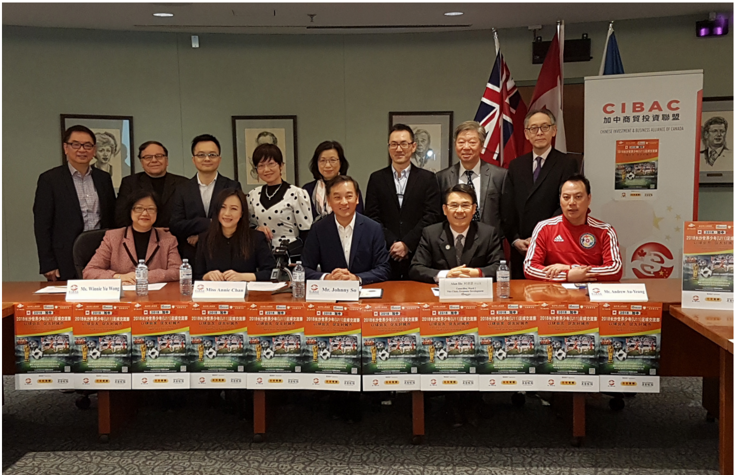
2018 Changsha International U11 Football Tournament Media Conference | 2018长沙国际友好城市少年(U11)足球赛发布会