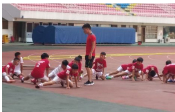
Canada team warm-up stretches to prepare for the game 队员在球场上积极练习