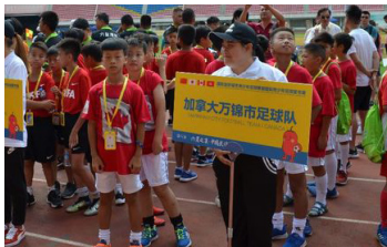
Canada Team at the Opening Ceremony 加拿大万锦市少年队员在等候开幕礼进行